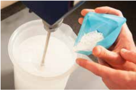
AURI, with the help of the Minnesota Corn Research & Promotion Council and Minnesota Soybean Research & Promotion Council, is currently working to help EarthClean develop TetraKO as a Class A fire retardant and obtain USDA Forest Service certification.