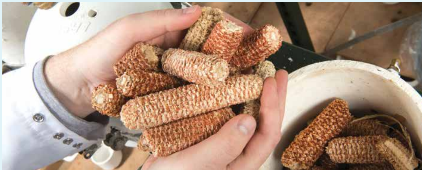
Initial results show materials like corn cobs (pictured above) can be even more effective than wood chips at removing nitrates.

“Nitrate fits the farmer’s definition of a weed. As they say, it’s like a plant out of place. When it’s in the right place it plays an essential role, but outside of that context, nitrate becomes a problem,” concludes Feyereisen. “We’re hoping bioreactors can be part of the solution.”