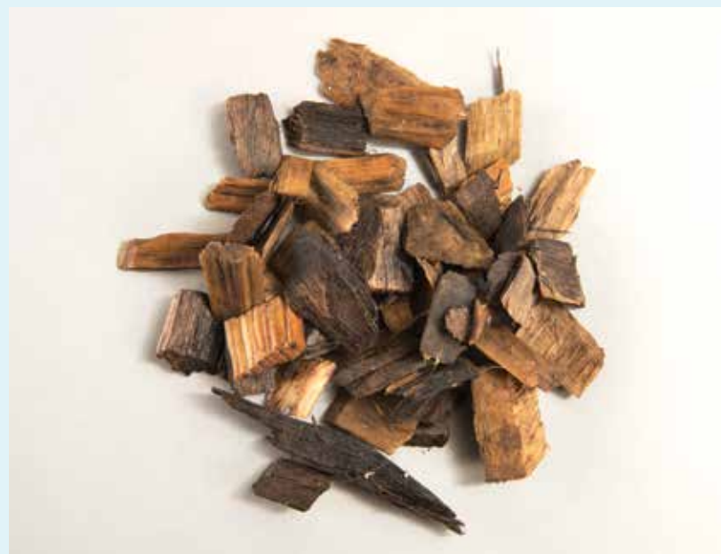
Traditionally, bioreactors have utilized media as such as wood chips, while this new project tested materials even more readily available to farmers.