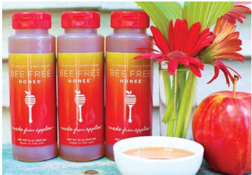
Bee Free Honee

Outcomes: Bee Free Honee products are in over 1,000 retail stores and available worldwide online. Sanchez and Elms were also awarded a Local Producer Loan Program loan from Whole Foods.