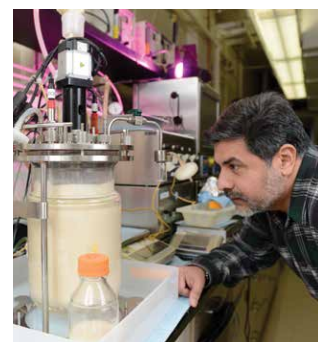
Sanos Nutrition's products are positioned to be cost-effective, when compared to all other single-cell proteins specifically grown for feed applications.

"Over the next 30 years, agricultural output must more than double to keep up with population growth. We believe that ingenuity and creativity will allow us to achieve more with fewer resources and make a better world for future generations."