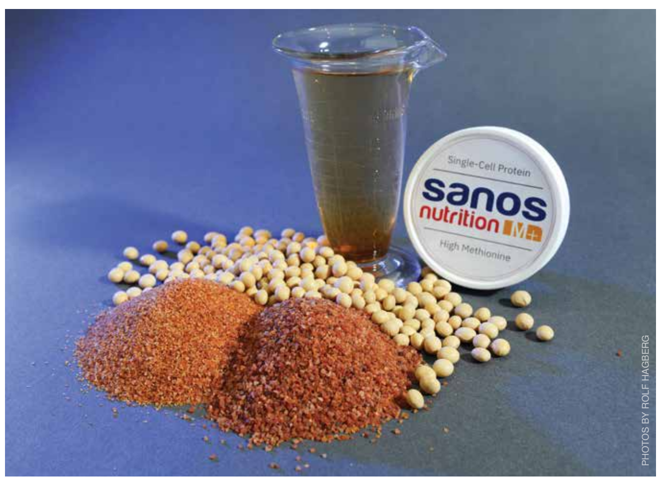
Sanos Nutrition and their innovative process were recognized in late 2018 as the winners of the Cleantech Open Midwest, which is part of the oldest and largest clean technology startup accelerator program in the world.

To learn more about Sanos nutrition, visit their website at www.sanosnutrition.com.