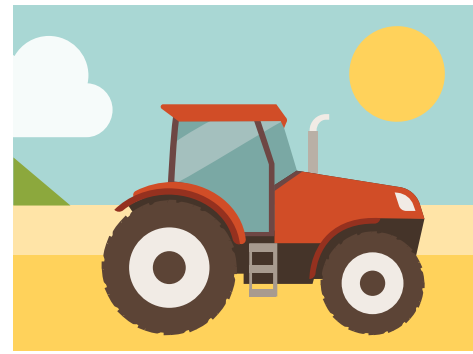
The Economic Impact of AURI Page 6