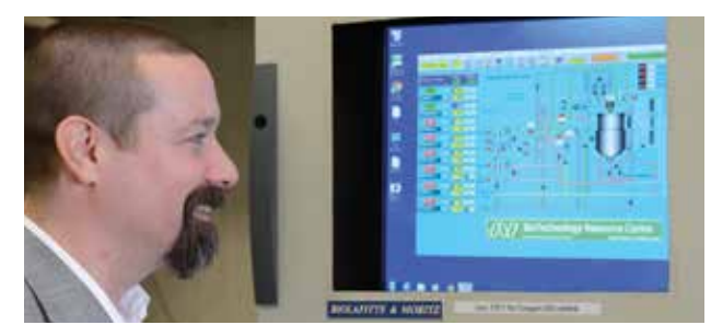
Sanos is uniquely positioned among its competitors in its amino acid balancer product.

"The original conversations that led to the development of Sanos Nutrition's proprietary process began as part of AURI's innovation network meetings."