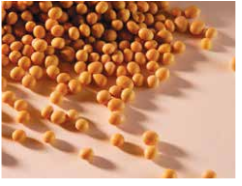
High Hopes for High Oleic Page 8