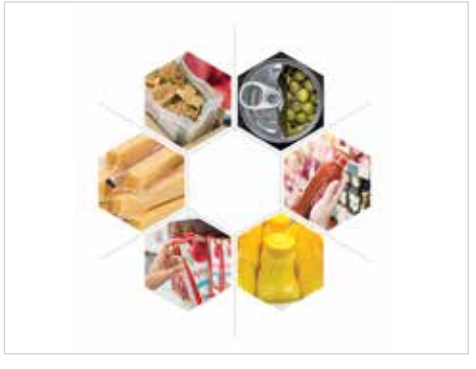
New Packaging Guide Page 10