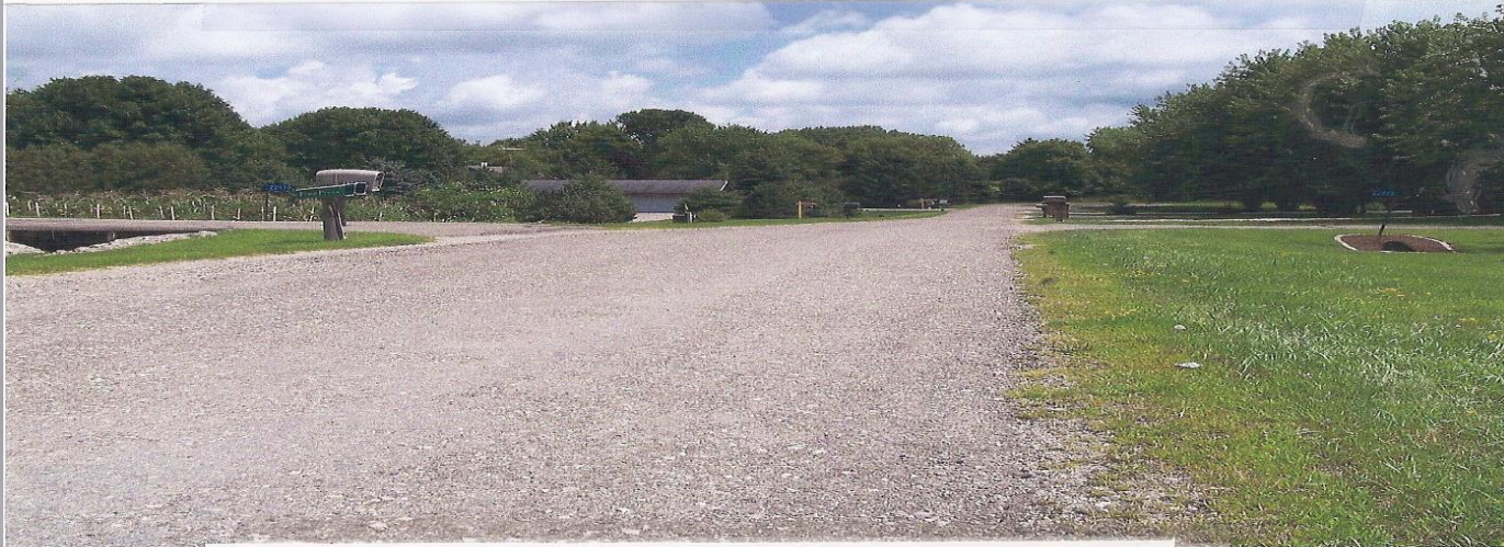
SECOND YEAR ON FIRST APPLICATION